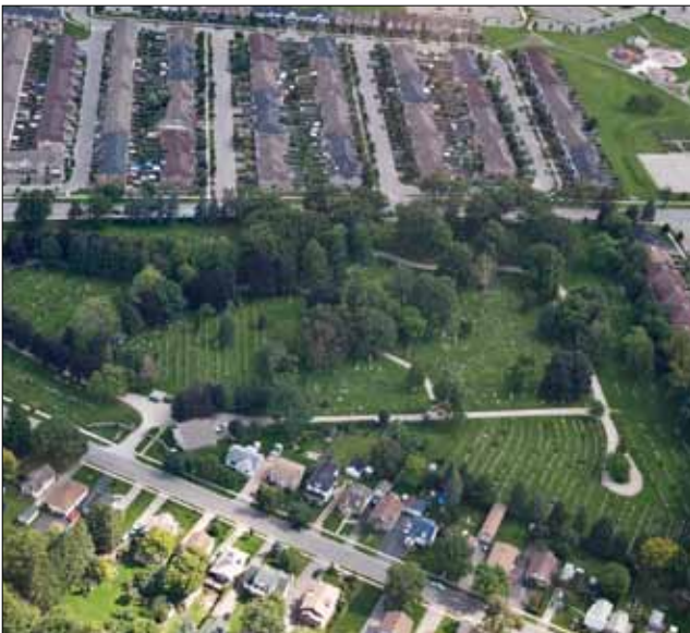
GREENWOOD CEMETERY 100 King Street Georgetown, ON

Main St. S (Hwy 25) & Cobblehill Rd. 2 Blocks South of Mill St. (Hwy 7)