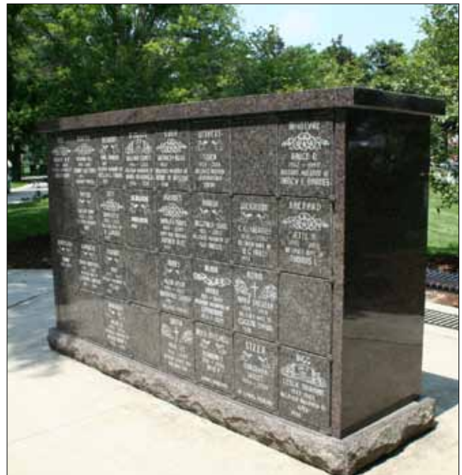
Hope Columbarium at Greenwood Cemetery ≈

A Monument Cleaning Service is available through the Town of Halton Hills. Seasonal cleaning of the monument will improve the stones appearance and legibility. Please see the Special Care Program information in the Halton Hills Cemetery package or contact the Cemetery Coordinator for details.