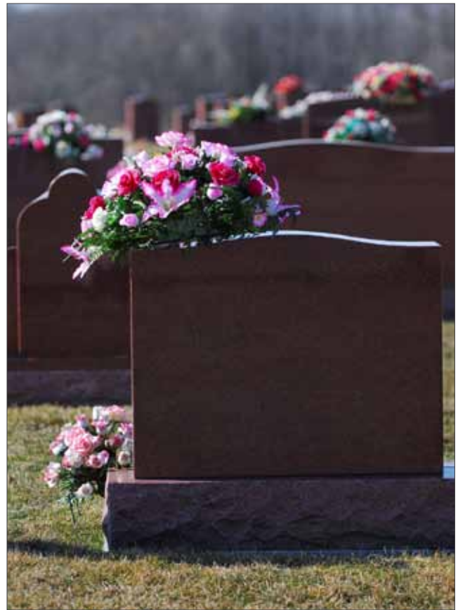
Securely affixed wreathes are permitted from October to April annually.