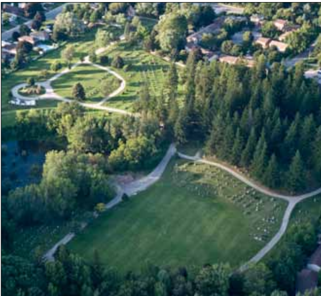
FAIRVIEW CEMETERY 20 Cobblehill Road Acton, ON

Town of Halton Hills currently operates and maintains Greenwood Cemetery located in Georgetown and Fairview Cemetery in Acton. The Town also preserves seven inactive heritage cemeteries, rich in historical significance that date back to 1830.