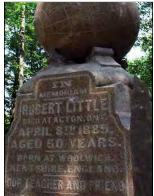
Robert Little Monument, Fairview Cemetery »

To install a monument, marker or foot marker that does not meet the dimensions outlined above, the Rights Holder must request permission for an exemption in writing to the Town.