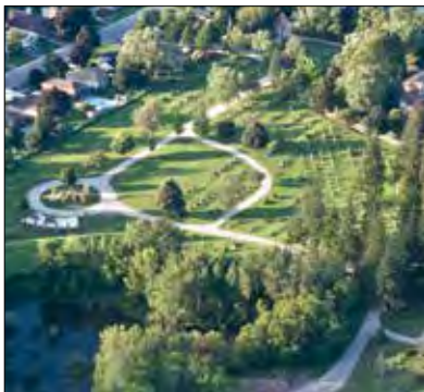
Photo of fairview cemetery

FAIRVIEW CEMETERY 20 Cobblehill Road Acton, ON L7J 1N9