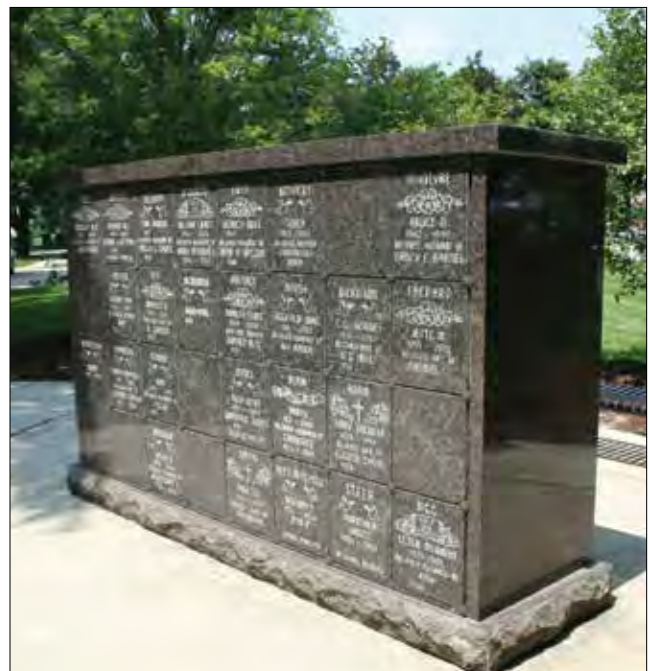
Hope Columbarium at Greenwood Cemetery ♡

Please contact the Cemetery Coordinator at 905-873-2601, ext. 2281 for details.