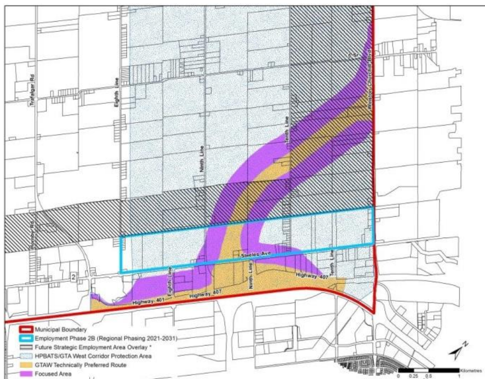
Figure 2- GTA West Corridors

The Premier Gateway Phase 2B lands are currently frozen for development until the GTA West EA process has progressed to a point that provides clarity on what lands are/are not required for the transportation corridor. Based on the draft TPR and FAA, we anticipate that a portion of the lands within the Study Area (approximately 19.42 ha) will be permanently precluded from development in order to accommodate the multi-modal corridor. The confirmed FAA area (approximately 47.79 ha) will likely need to be excluded from the Secondary Plan exercise since the MTO has indicated that properties within the FAA could be directly impacted by the GTA West Transportation Corridor, ancillary uses or if refinements are made to the TPR; therefore the secondary plan will need to take into consideration the location of the confirmed FAA and plan for appropriate uses along the area.