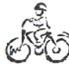
Bike and Pedestrian Safety