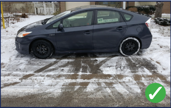
A vehicle can park on the paved portion of the driveway, facing the direction of traffic is permitted.

Vehicles are permitted to park on the paved boulevard section of a driveway.