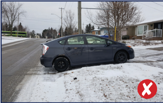
Vehicles that are parked on the landscaped portion of the boulevard or hanging over the sidewalk or curb/road edge will be ticketed.

This brochure contains current consolidated versions of the most common by-laws for the Town of Halton Hills. A consolidated by-law is one that includes all amendments that have been made to it. The information is provided as a convenience only and should no be relied on as authoritative. For the authoritative text of the law, official volumes and office consolidations may be obtained from the Clerk’s Division at Halton Hills Town Hall.