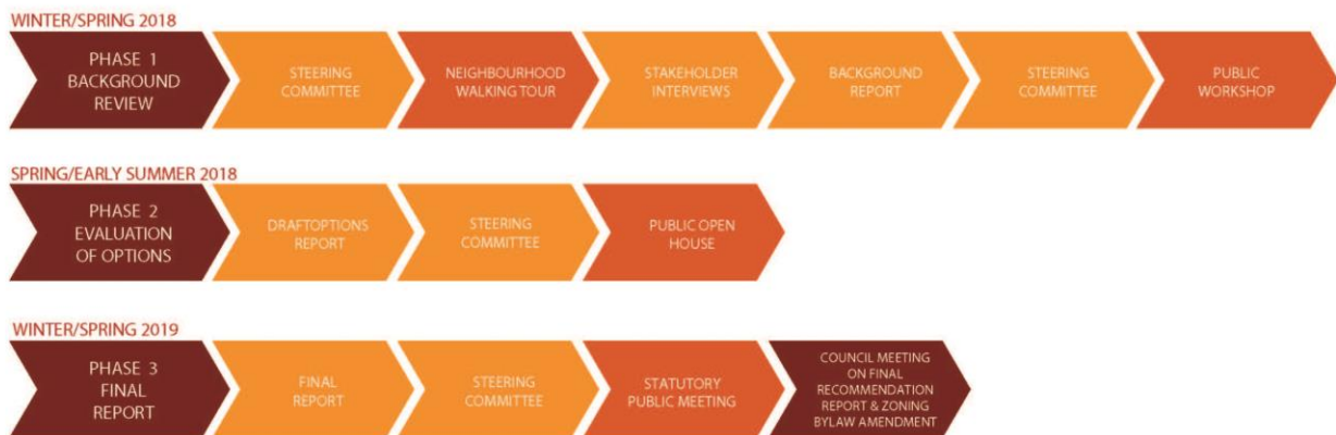
Figure 1: Glen Williams Mature Neighbourhoods Study Timeline

Phase 1: Background Review included background research, stakeholder interviews, and the walking tour to obtain an understanding of the neighbourhood characteristics valued by Glen residents. A Background Report (April 2018) was prepared outlining the findings of the Phase 1 work, and this information was presented at May 3, 2018 public workshop. The workshop included active participation of attendees to discuss and evaluate various potential tools and options for regulating large home rebuilds in a manner that would protect mature neighbourhood character.