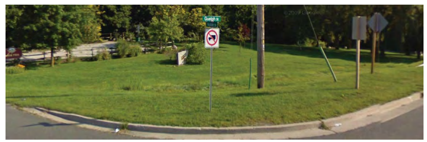
McNab Park is a significant open space and should be preserved and enhanced. Improved visibility (i.e. signage) is encouraged.

• Power lines should be buried in the Hamlet Community Core.