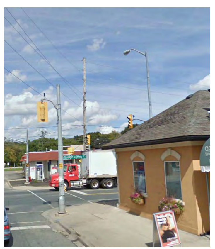
Large truck traffic was recognized as a significant issue for all groups during the workshop discussion.

• Hydro lines should be buried within the Hamlet Community Core.