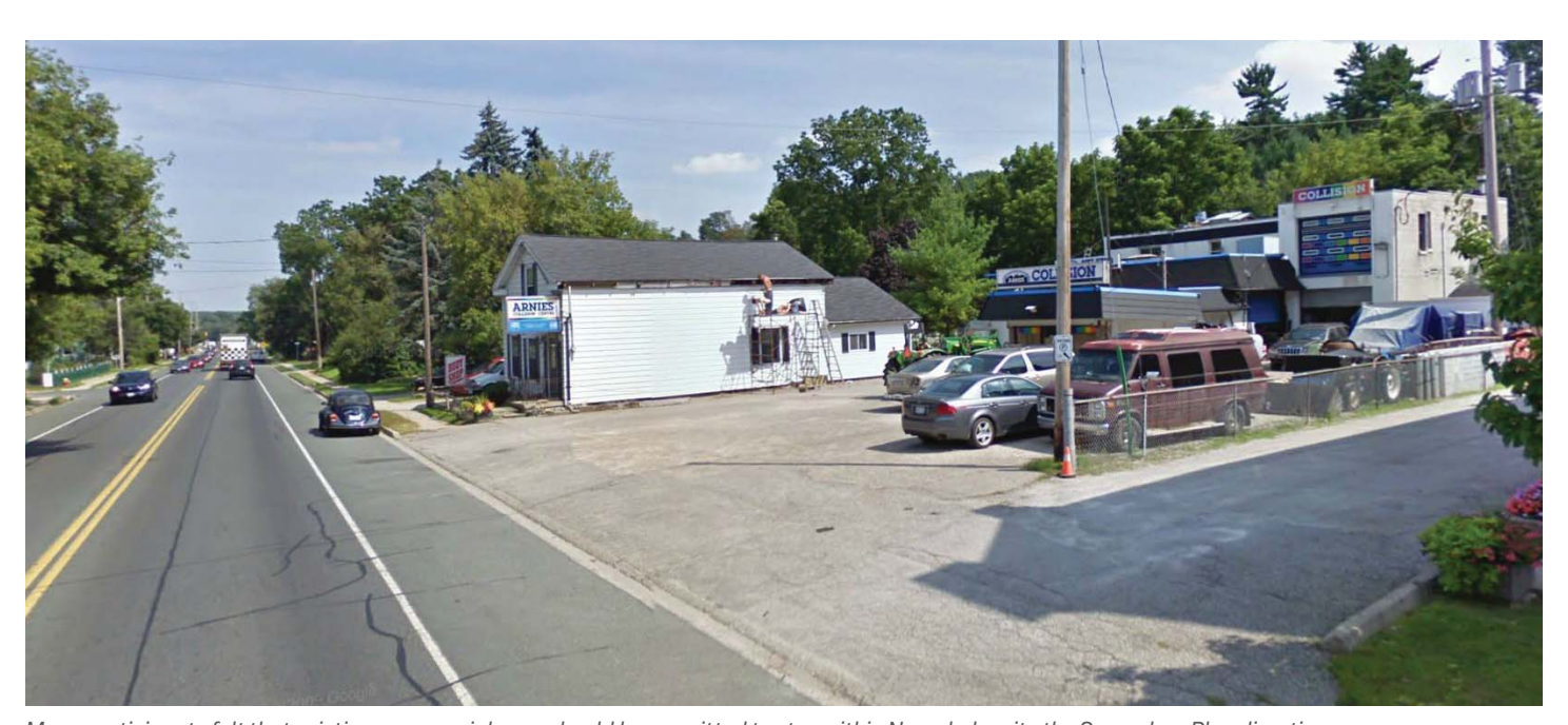
Many\ participants\ felt\ that\ existing\ commercial\ uses\ should\ be\ permitted\ to\ stay\ within\ Norval,\ despite\ the\ Secondary\ Plan\ directions.

• Sidewalks along Highway 7 and Adamson Street should be extended in all directions to attract more pedestrians and cyclists to the Hamlet Community Core.