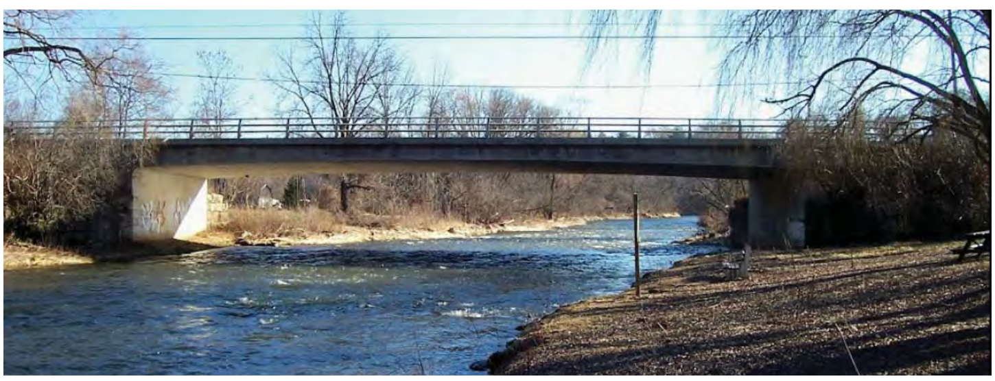
The Credit River (and valley) is a significant component of Norval's natural heritage system.