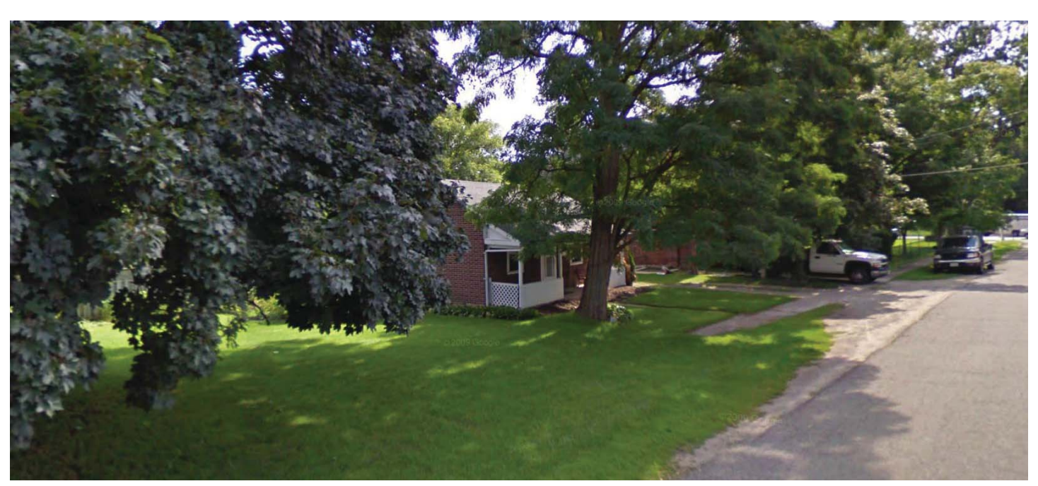
Participants were in favor of the existing heritage character of the community, characterized by cottage style residential dwellings on large lots.

• The Norval Quarry should be prohibited.