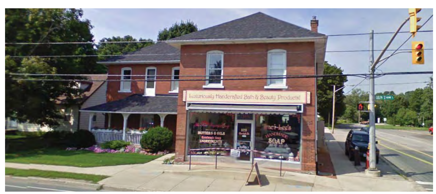
Buildings in the Norval Community Core should address Highway 7 and Adamson Street.