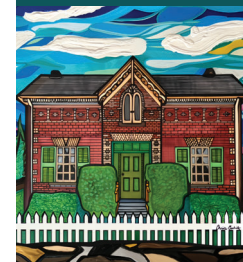
Chris Cachia, Deveraux

Chris Cachia's work blends everyday realism with dreamlike, fantastical elements, drawing inspiration from magical realism and contemporary illustration styles. Working in mixed media and photography, Chris explores landscapes and popular culture.