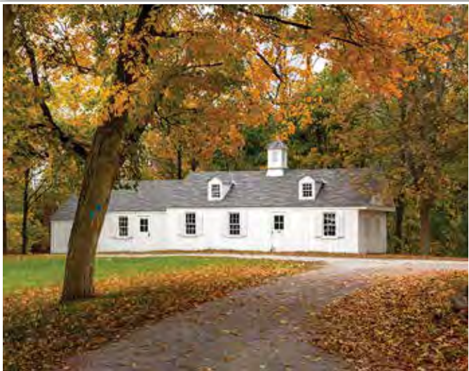
Heritage farmstead at Scotsdale Farm