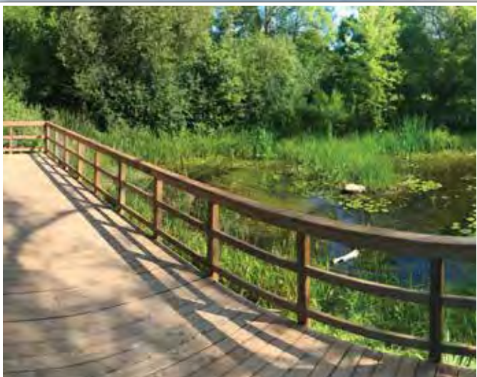
Wetland viewing platform at Willow Park Ecology Centre