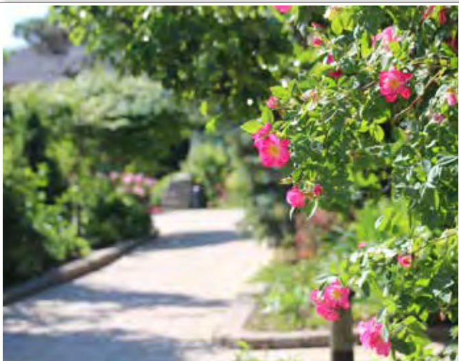
Floral pathways in Old Seedhouse Garden, Dominion Gardens Park

Visit our website: haltonhills.ca/trails