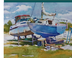
Ghazi Toutounji, watercolour

This exhibition features recent work created by 18 members of The Mississauga Watercolour Society of various subjects in watermedia including landscapes, florals, portraits, and abstracts.