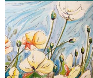
Artwork by North End Arts Girls member

The North End Art Girls is a collective of female artists that formed in 2018 with a shared mission to promote and support the work of women artists across Ontario. Brought together through a spirit of collaboration and