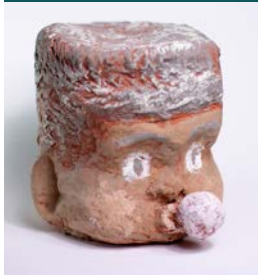
Clarke Miles, Before the Pop , Ceramic Sculpture. 2025 HBHAS Exhibition

Black identity, history, and culture through a diverse range of artistic media.