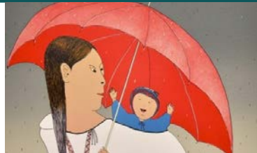
Ningeokuluk Teevee, Red Umbrella , 2015 lithograph on paper

Explore a selection of works, from traditional to contemporary representations, that showcase the rich cultural heritage and artistic expression of Indigenous artists.