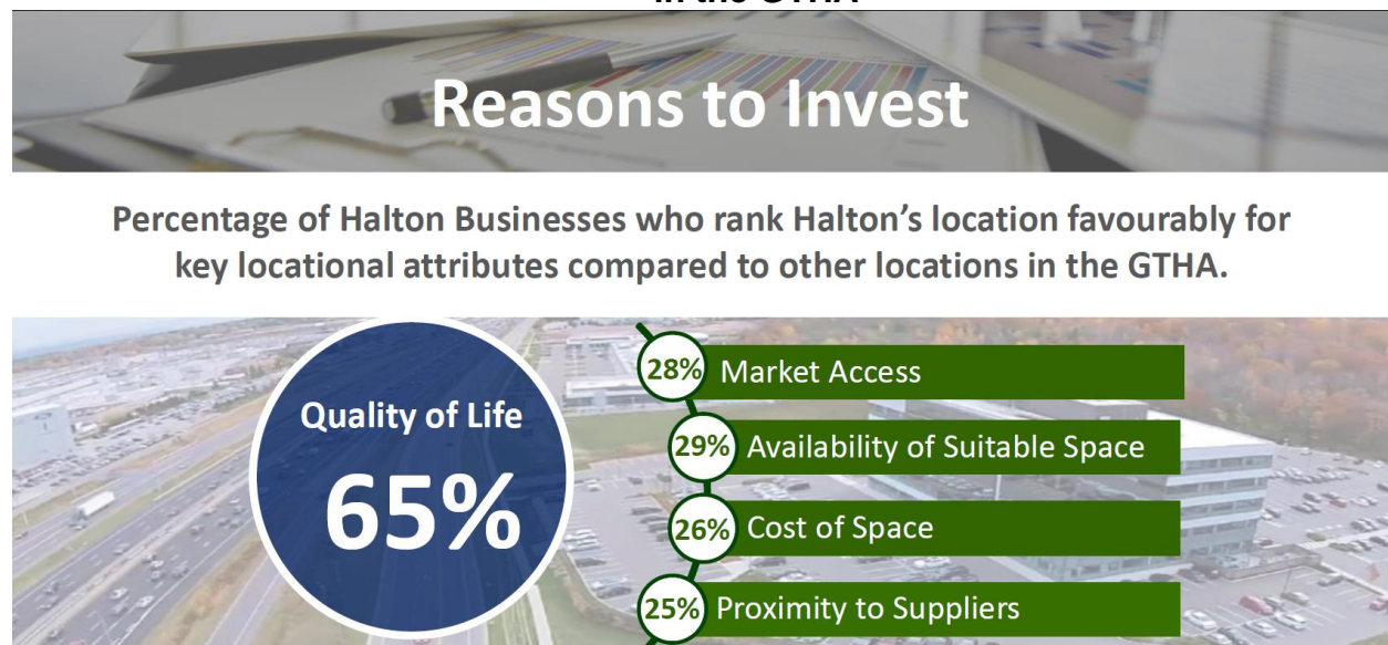
Figure 1: Reasons to Invest in Halton Region compared to other locations in the GTHA