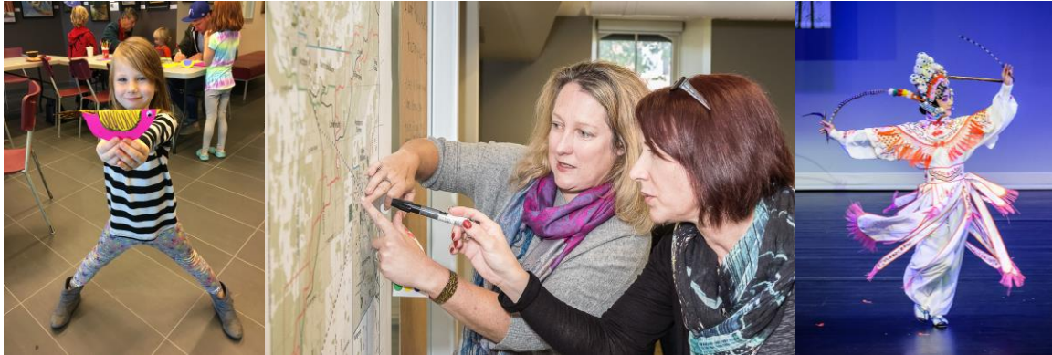
Photos: Culture Days with the Helson Gallery, Public Art Master Plan Community Consultation, Wenjiang Festival

The following are highlights of the status and next steps of Town-led initiatives that are contributing to the Cultural Vibrancy of Halton Hills.