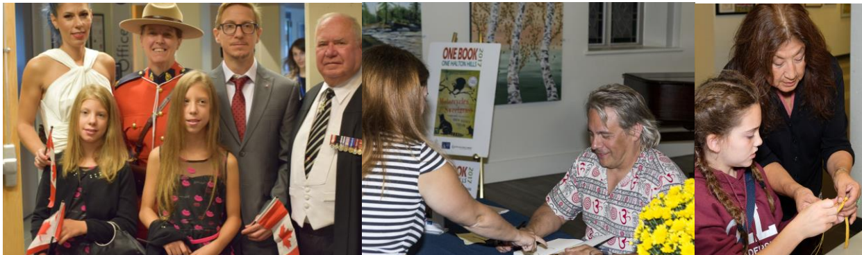
Photos: Canadian Citizenship Ceremony, One Halton Hills One Book with Drew Hayden Taylor, Dream Catcher Workshop

The Halton Hills Public Library enriches the community with extensive cultural programming throughout the year, often in coordination with community partners. Highlights of 2017 successes include: