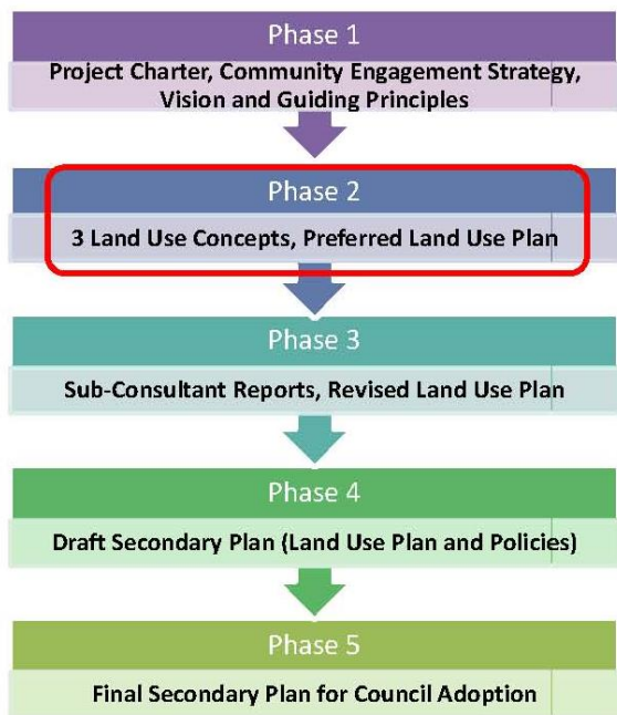
Figure 1: Vision Georgetown Work Plan - Key Deliverables by Phase

for preparing detailed land use studies on transportation, servicing, sustainable design etc. during Phase 3.