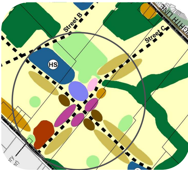
Figure 3: The Components of the Community Core

The Community Core responds to public comments which indicated a desire for a central hub for community activity, surrounded by a mix of housing types and the integration of a number of uses to provide opportunities to share facilities.