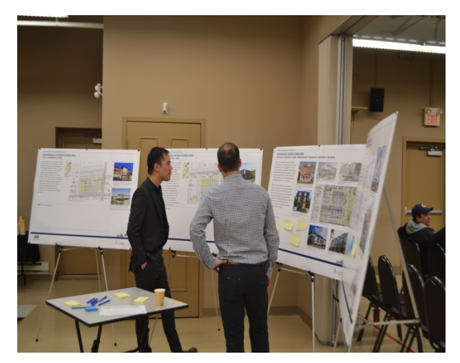
Participants provided their comments on the display boards providing information on the Draft Secondary Plan Policies, draft design guideline, community core, and transportation plan,