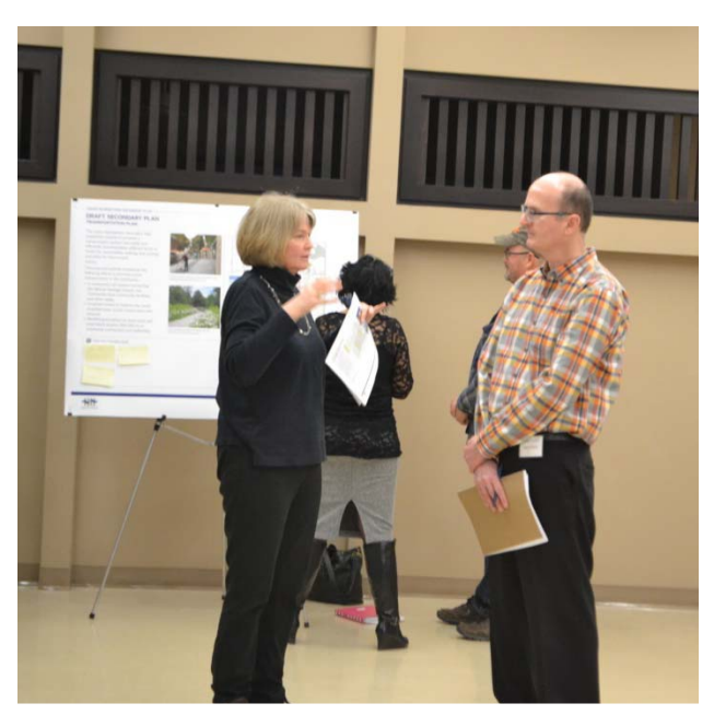
The open house was held at the Hillsview Active Living Centre in Georgetown

The first part of the meeting was a drop-in format with display panels providing information on the Secondary Plan policies including permitted land uses, the urban design guidelines for high density/mixed use areas, major/local commercial areas and major institutional/school and community centre areas, the community structure and