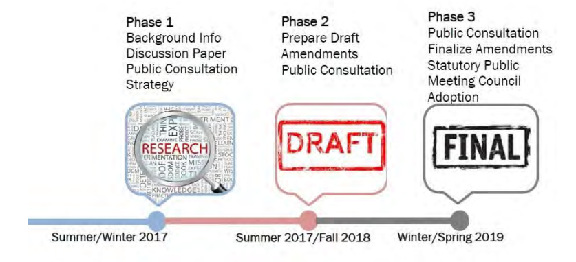
Figure 1: Rural Review Work Program

The Rural Policy and Zoning Review is being undertaken to identify the changes that need to be made to the Town's Official Plan, with regards to the Natural Heritage System, Agricultural System and mineral aggregate resources, in order to bring it into conformity with the Regional Official Plan (ROPA 38). The Study is comprised of three phases (see Figure 1). The geographic areas of the Town affected by the Study are shown on Figure 2.