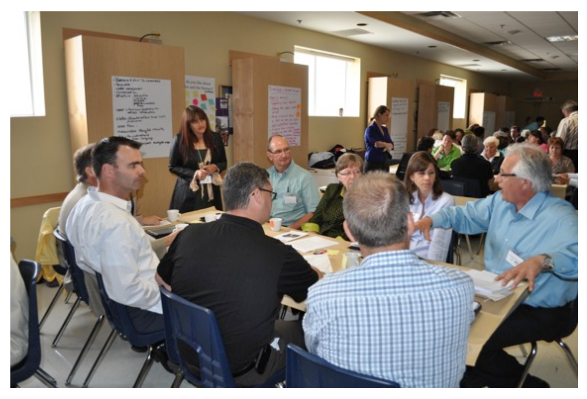
Figure 2: We will bring people with different ideas and perspectives together in a process that involves change.

Public consultation is an important, indispensable component of the planning process for Vision Georgetown. Through the actions identified in this Community Engagement Strategy, Town staff and members of the project consulting team aim to bring the range of groups/ideas/perspectives/levels of awareness together in an important process that involves change.