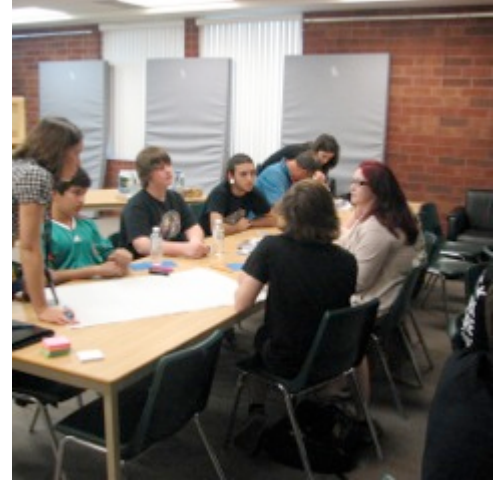
Figure 4: We will identify community groups not typically engaged (such as local youth) and engage them in the process in a meaningful way.