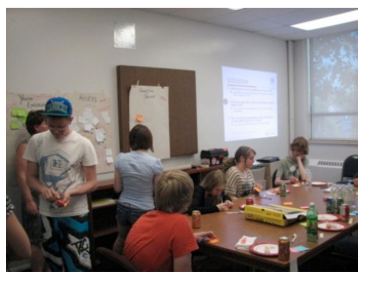
Figure 5: We are exploring innovative and exciting ways to engage youth in Vision Georgetown.

Youth are typically underrepresented in this type of planning exercise. As a starting point, the project team proposes to meet with and work through the Mayor's Youth Action Committee (who could potentially serve as conduits to youthand from various constituencies). The team will seek the Committee's best advice on engaging youth in Halton Hills. There is currently a youth engagement initiative underway to develop a framework, policy and communications plan to increase youth civic engagement. One of