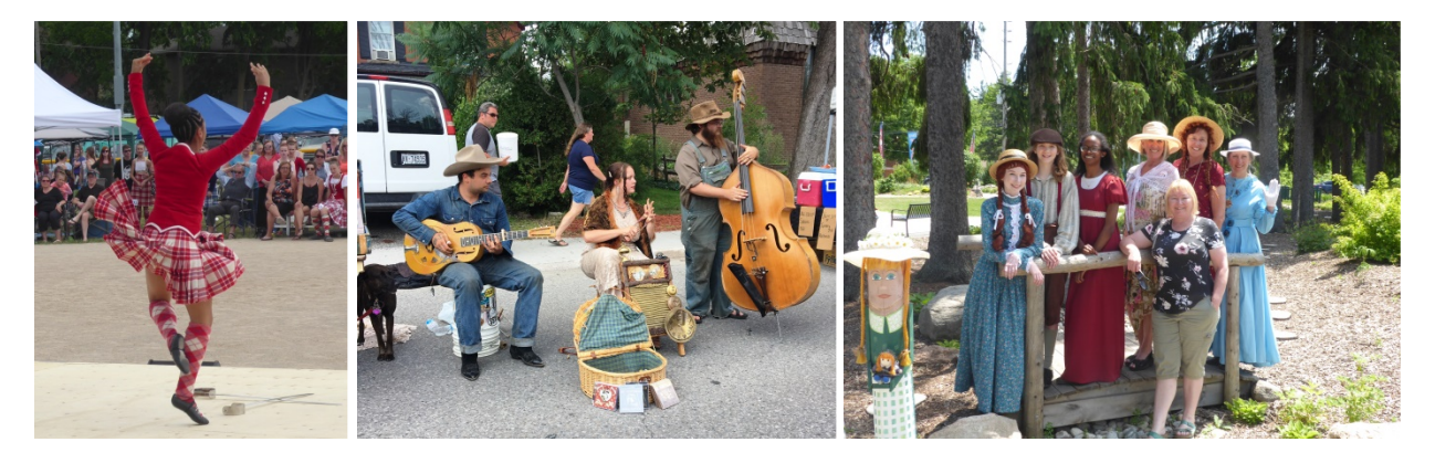
Photos: Highland Games, Leathertown Festival, Anne of Green Gables Day

The following are highlights of community-led initiatives that are contributing to the Cultural Vibrancy of Halton Hills: