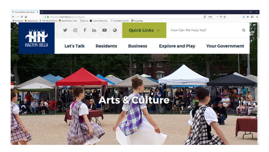
Screenshot of the new Arts and Culture webpage