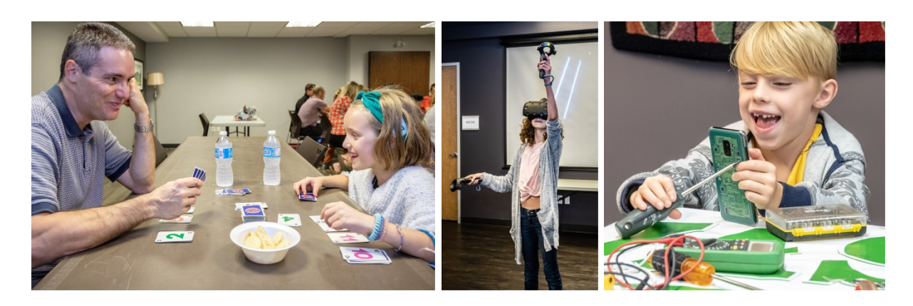
Photos: Library Programming: Boardgame Night, Virtual Reality, Repair Cafe

The Halton Hills Public Library enriches the community with extensive cultural programming throughout the year, often in coordination with community partners. Highlights of 2018 successes include: