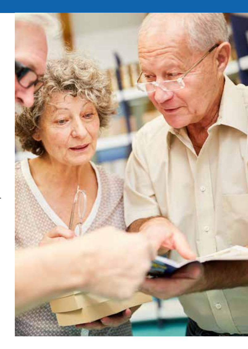
The Hillsview Newsletter has detailed program information, meaning it gets picked up and read often!